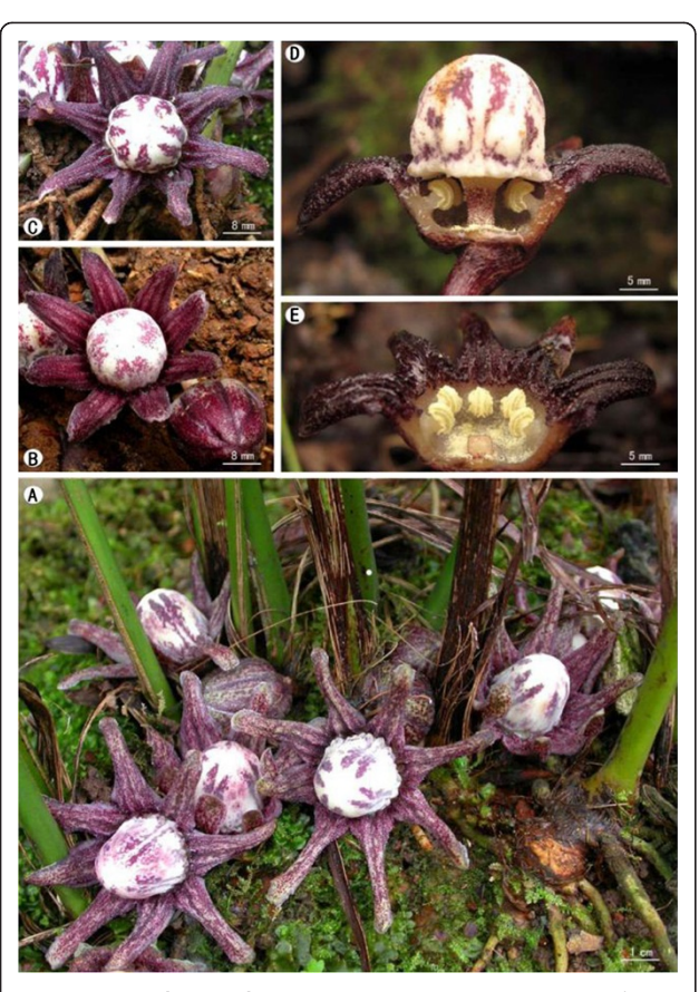
Figure 5 Aspidistra subrotata Y. Wan & C. C. Huang. A, Habit; B, C, Flowers; D, E, Flower, dissected to show stamens and pistil.