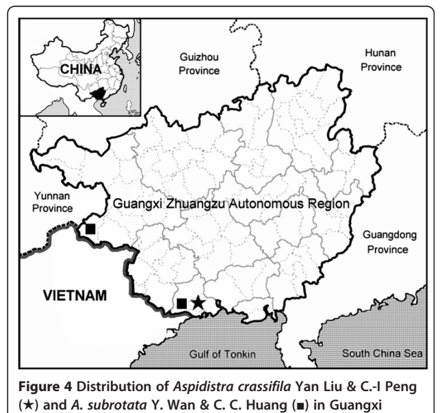
Zhuangzu Autonomous Region, China.

The specific epithet ' crassifila ' is derived from its enlarged filaments.