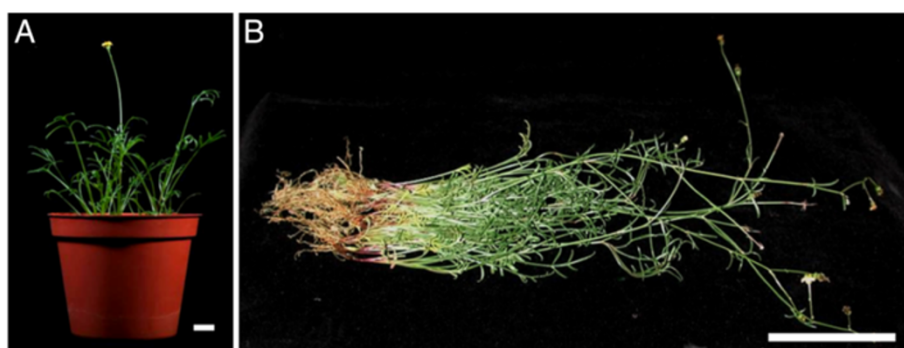
Figure 3 Tissue culture plants of G. tenuifolia . (A) Successfully acclimatized; (B) Tissue culture plants in greenhouse (3½ month old). (Bar A = 1.3 cm; Bar B = 6 cm).

culture raised greenhouse plants may be due to differences in the maturity of the plant materials. Media supplemented with PGRs did not have significant influence on the contents of oleanolic acid and luteolin in in vitro shoots (Data not shown).